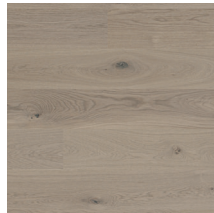
Oak Rustic Soft Beige