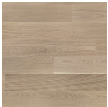
Oak Nature Authentic